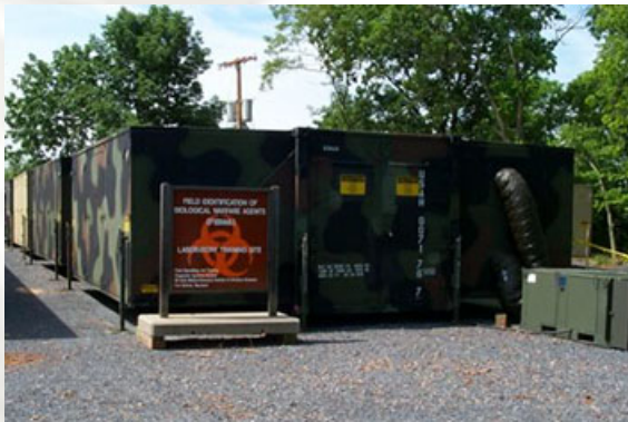
FIBWA Field Training Site