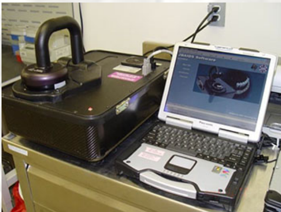
JBAIDS Analyzer (Idaho Technology)