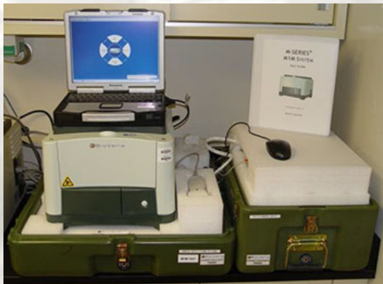
M1M (Roche Diagnostics, Inc.)

USAMRIID's MISSION: To protect the Warfighter from biological threats. Be prepared to investigate disease outbreaks or threats to public health.